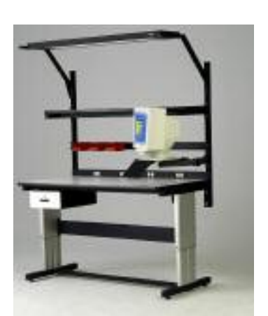
Electric Station with optional accessories.