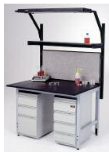
RTW Table with optional accessories.