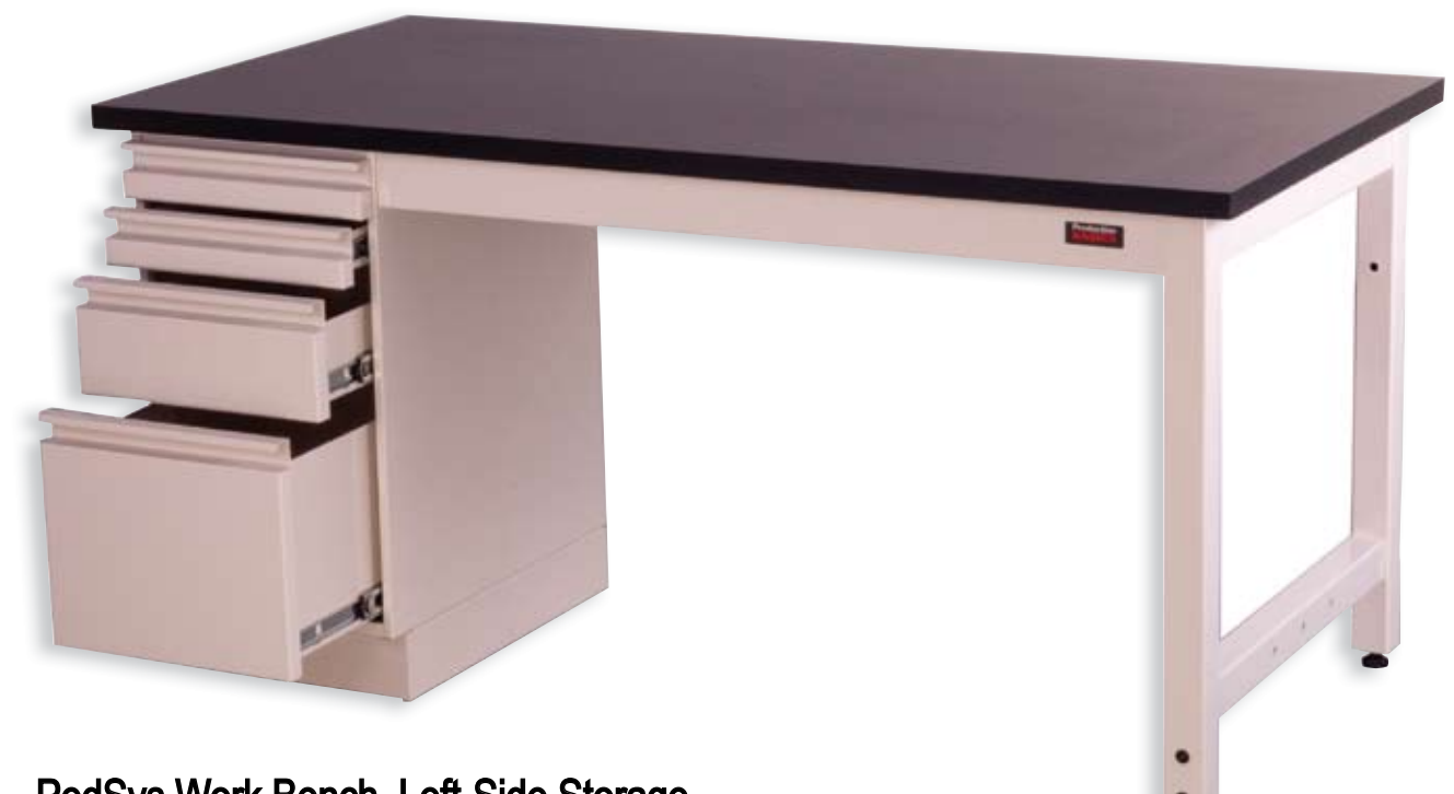
PedSys Work Bench, Left-Side Storage